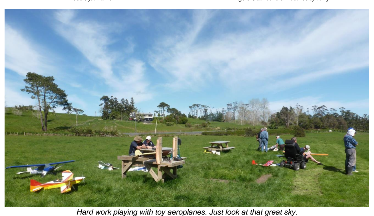
Thata work playing with toy acropianes, sast look at that great sky.