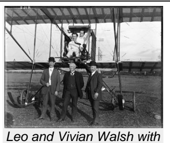
the three syndicate financiers of their first aircraft (Manurewa).

winning the prize ... I have had several tests. Last week's was my most successful one, the machine rising readily."