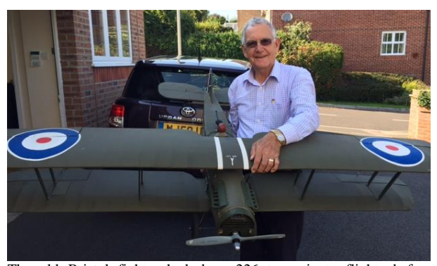
The old Bristol fighter had done 226 ten minute flights before destroying itself with one bearing replacement during the engine life.

which is still very forgiving after all this time. Probably my favourite planes at present are my Piper Cub, my Magnatilla and my 4Star60.