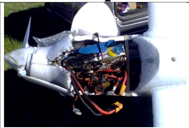
Who was flying the hottest plane at Twilight? Well from the looks of this it was Wayne. Quite impressive I thought.

"DON'T PANIC," seems like good advice and should not only apply to Dad's Army.