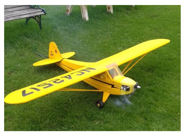
My Great Planes Piper Cub has a 75 Inch wingspan and has an OS 70 FS engine