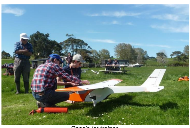
Ross's jet trainer.