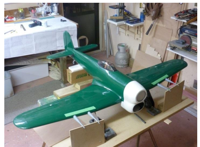
Pete's typhoon waiting to have the cannons then it's ready for painting. Isn't it shaping up well.